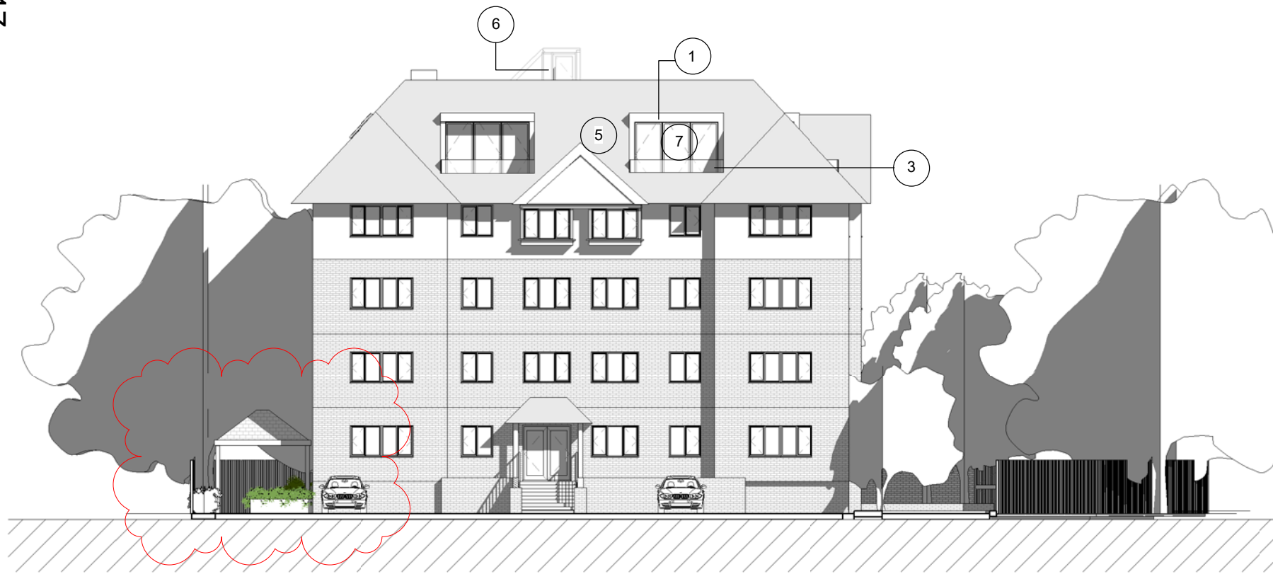
NORTH ELEVATION 1:200